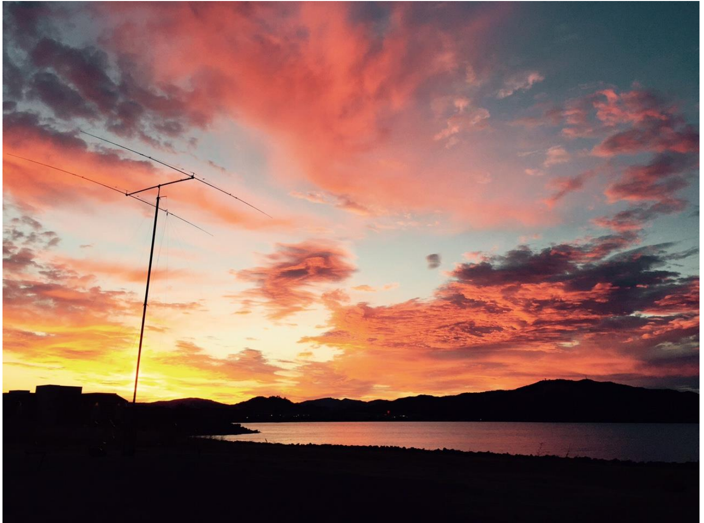
Sun sets Saturday night on the 40M beam