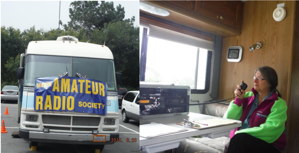
Net Control Stinson Beach