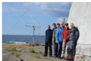
Next to the Market Reef EME array: (L-R) OH6ZZ, OH2BH, OH8MSM, OH6KZP, OH2TA, and OH2GEK.

Suominen, an early VHF pioneer, was deeply involved in the science of VHF communication and strongly believed that 2 meter EME contacts