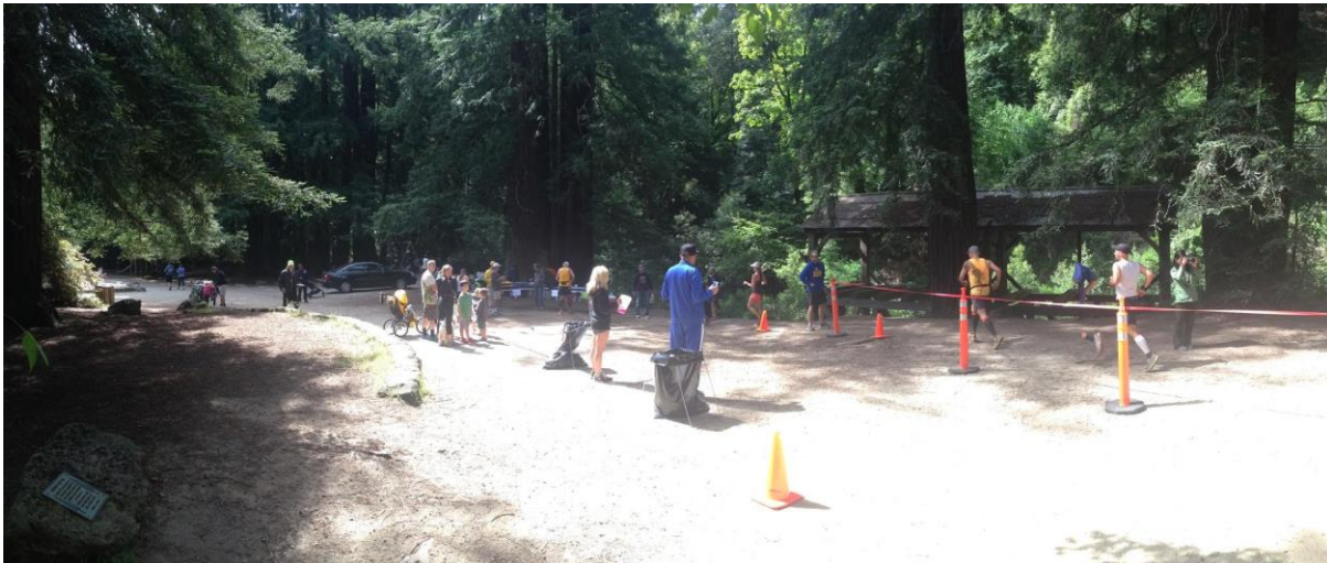
Old Mill Park half way point